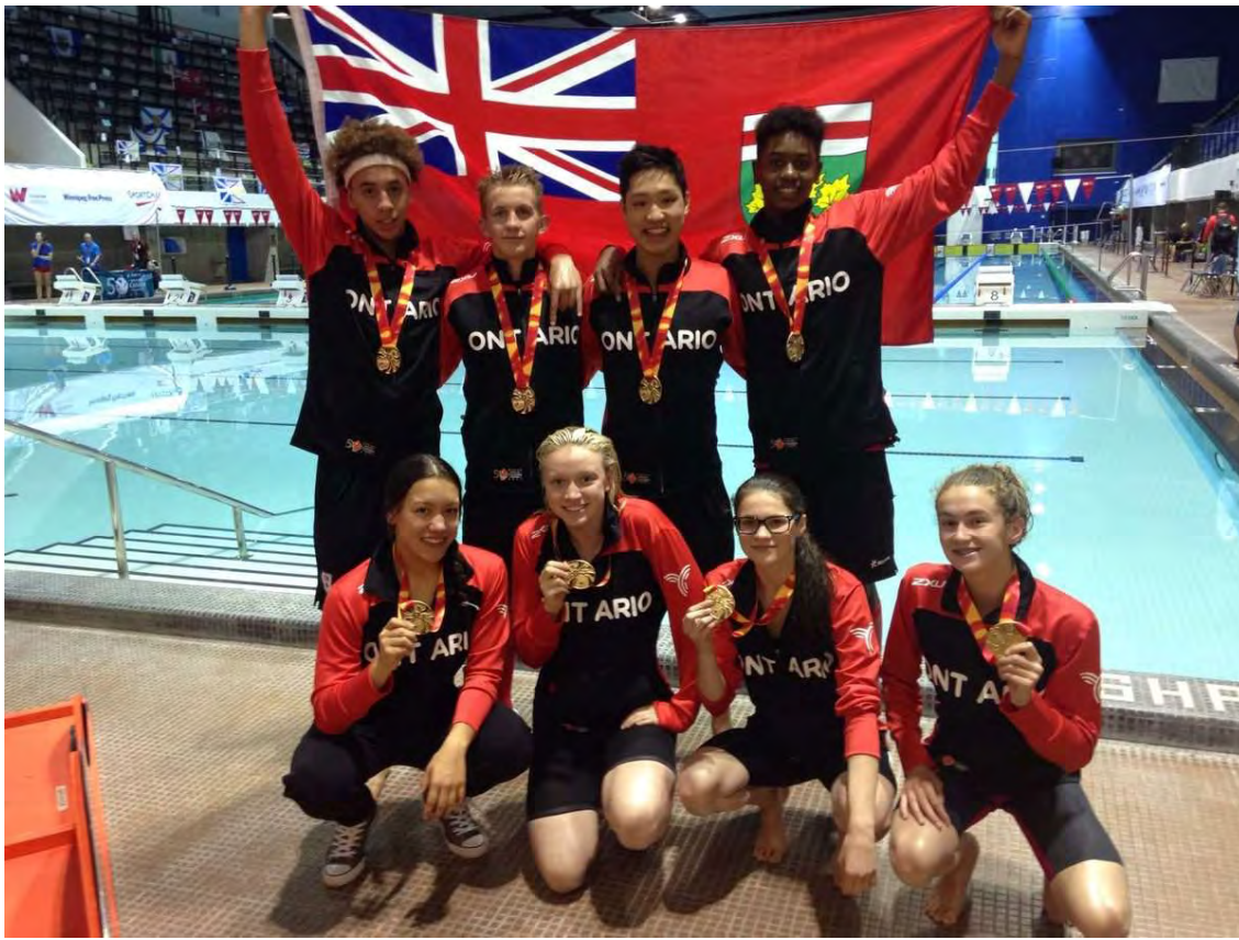
Ontario Swimmers at the Pan Am Pool in Winnipeg during the Canada Games (< photo to the left)