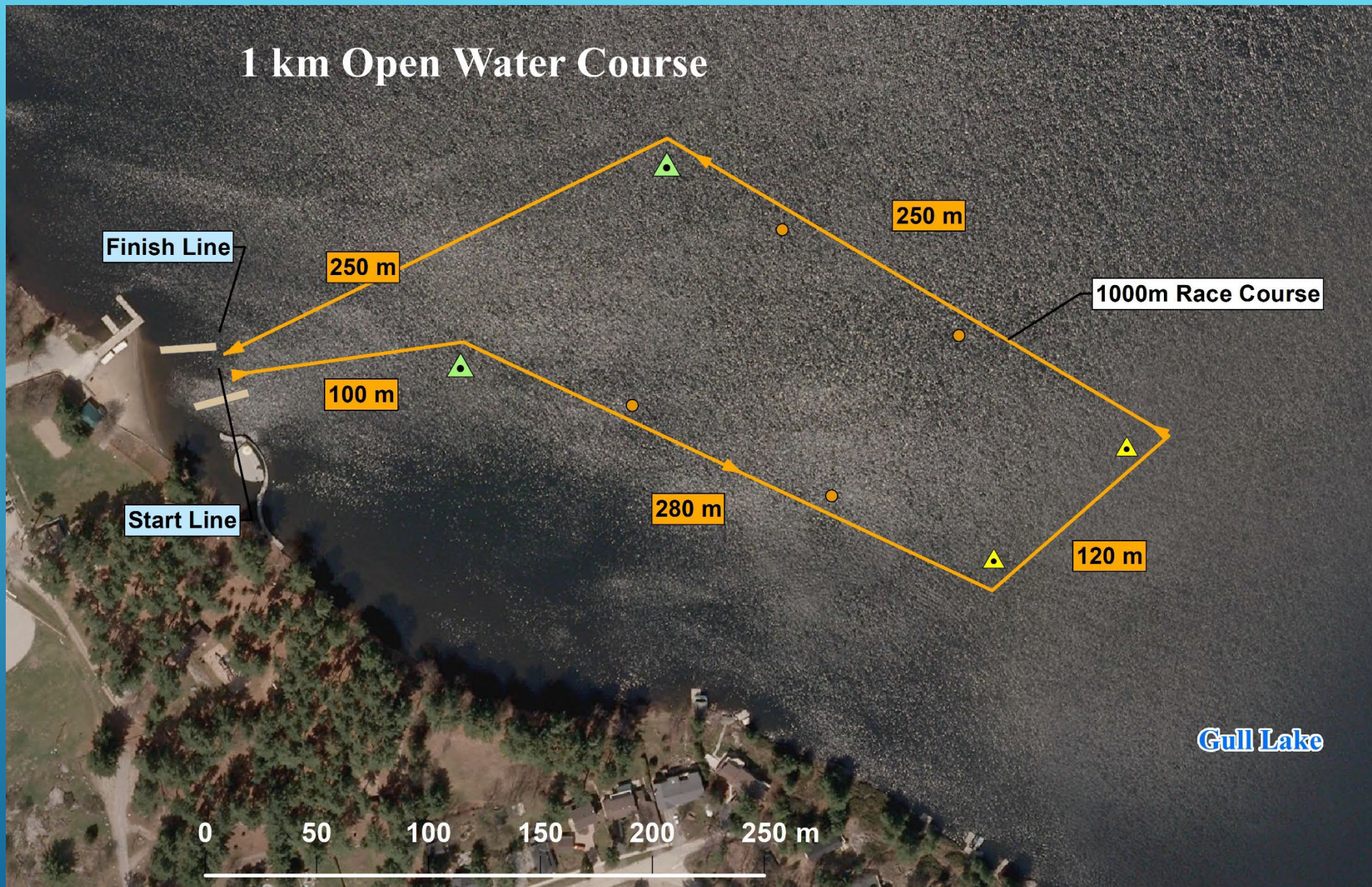
THE COURSE 1 KM